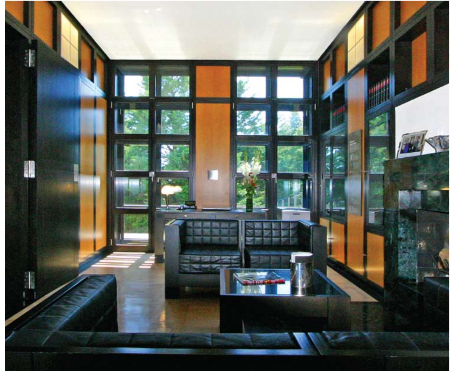
Left: Fireplace in Reception Hall with Paintings by Markus Lüpertz, Right: Library