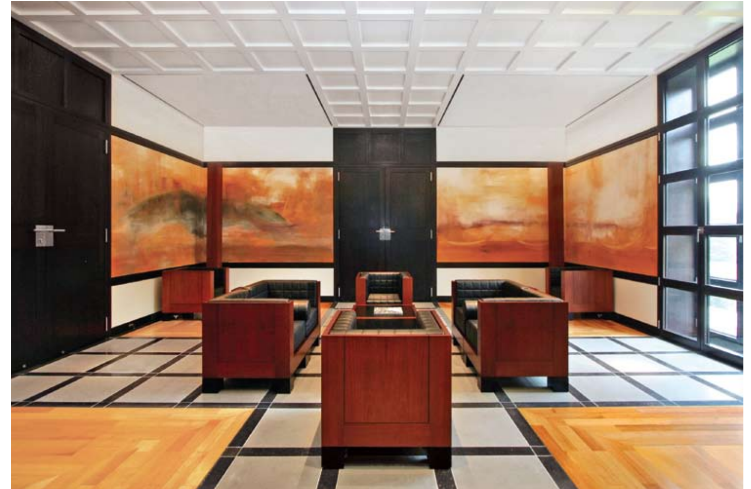
Gentlemen's Sitting Room

Next door, paintings by Christa Näher depicting the four elements – air, water, earth and fire – embellish the gentlemen's sitting room. In the small adjacent library, Ungers' wood paneling design, leather furniture and marble fireplace, together with the view of evergreen firs from a bank of square windows, lend this room a welcoming warmth.