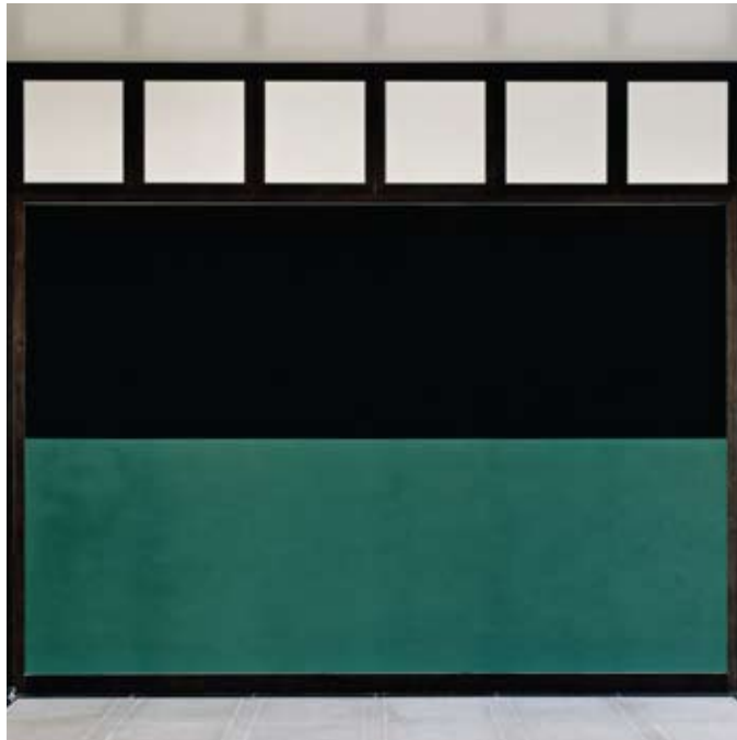
Painting by Gerhard Merz and Wall Detail, Entrance Hall

The tone is set in the entrance hall, where two wall paintings by Gerhard Merz, in cobalt greens and deep-pigment blacks, set horizontally parallel against one another, complement the paneled walls and marble floors, completing the room.