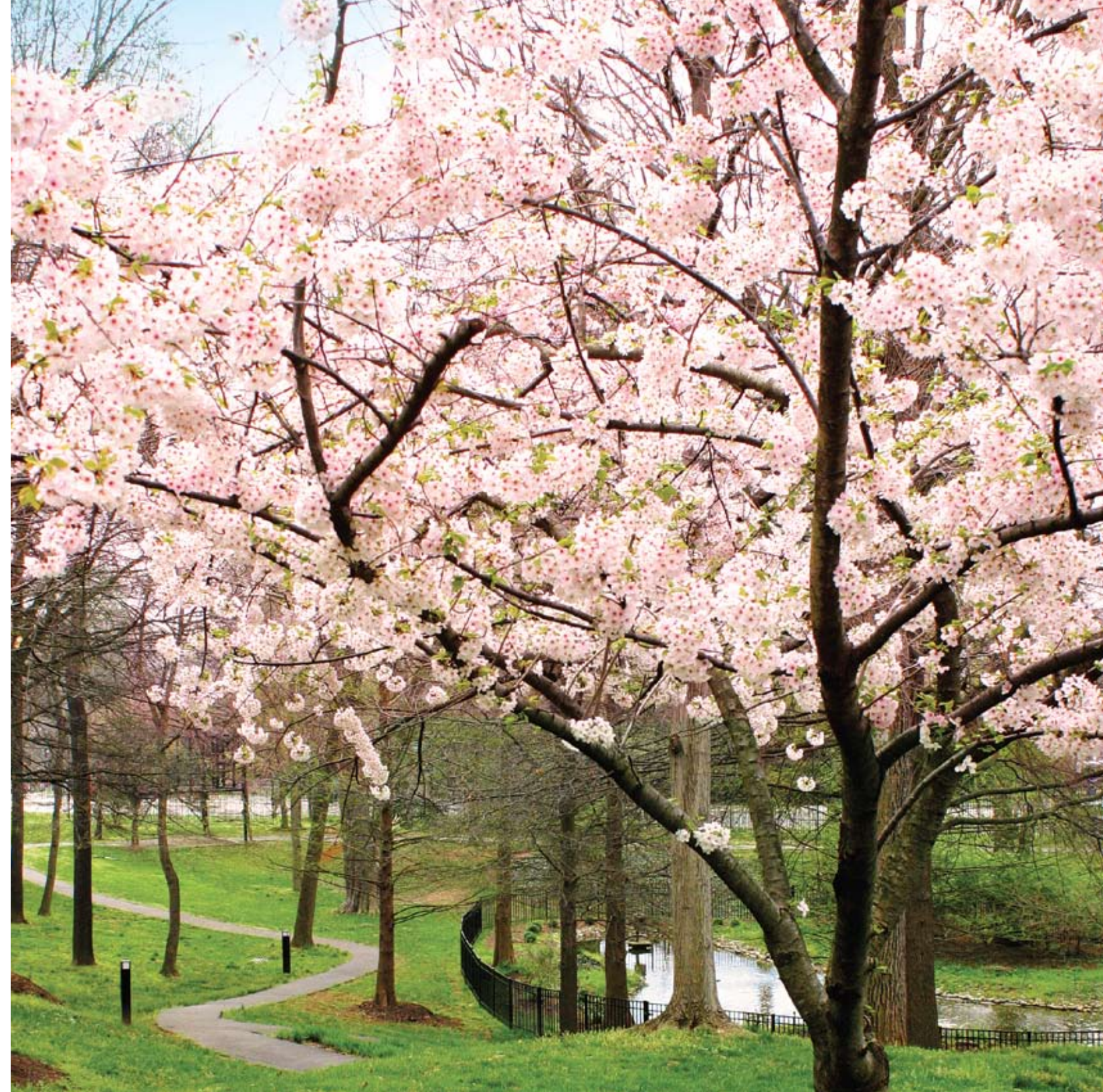
Cherry Tree in Bloom on the Residence Grounds