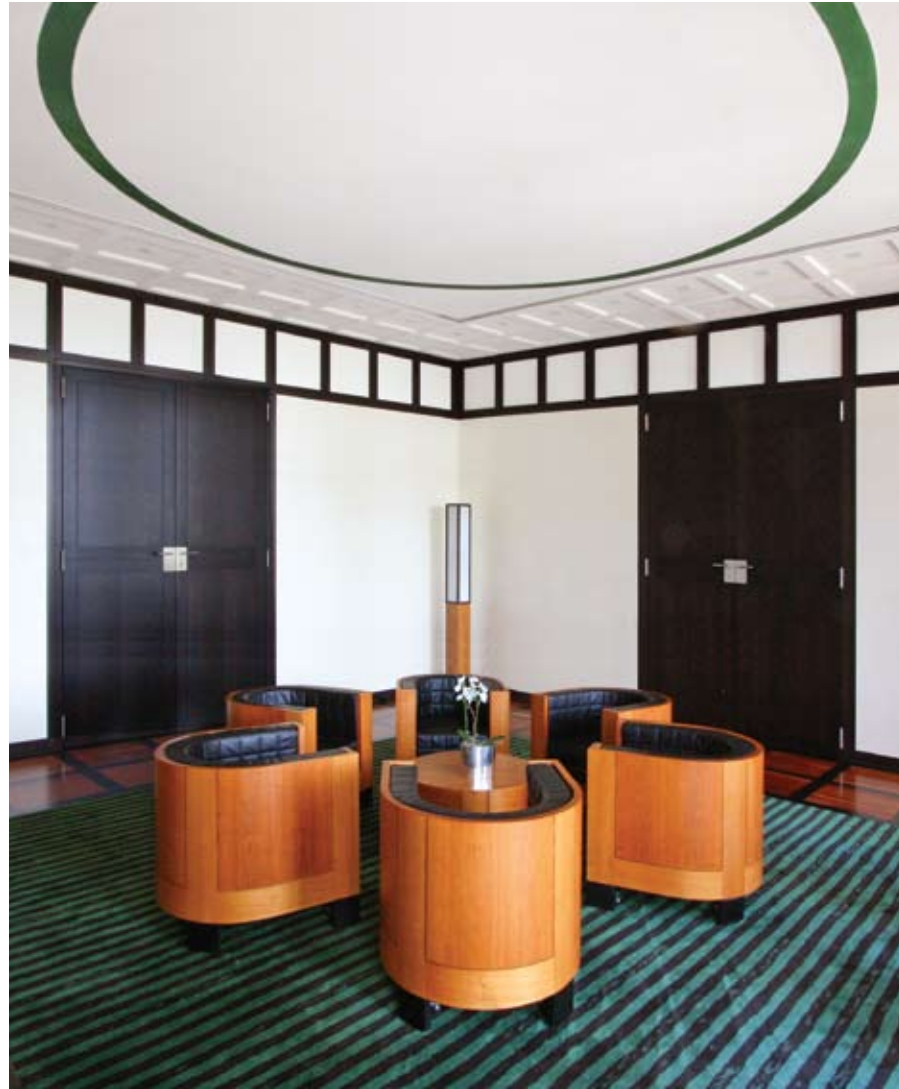
Ladies' Sitting Room

The ladies' and gentlemen's sitting rooms are located off the western side of the reception hall. The robust colors – olive green and brown – of the carpet designed by Rosemarie Trockel greet visitors to the ladies' sitting room. Trockel's corresponding ceiling painting of an olive green oval set against white also defines the intimate gathering space.