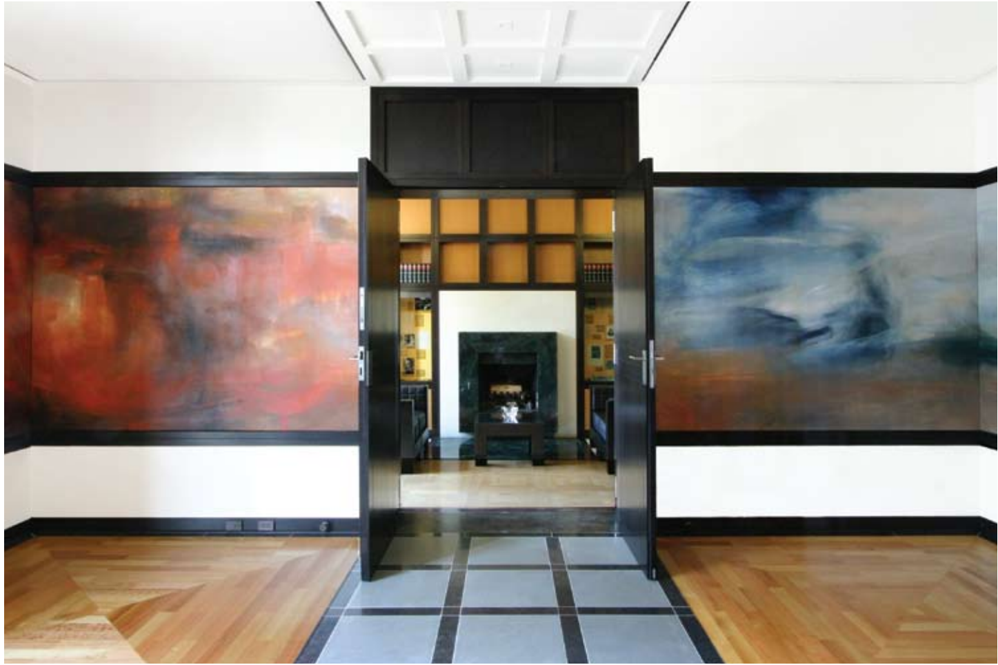
Gentlemen's Sitting Room and Library