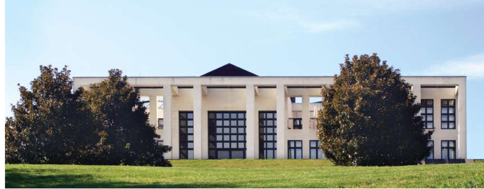
Left: View of Portico, Right: View from Reflecting Pool

This building should exemplify that general forms and typologies from architectural history can easily be combined in a rational, modern way adequate to its time and function. To achieve this, traditional building forms and elements are alluded to, though not in a