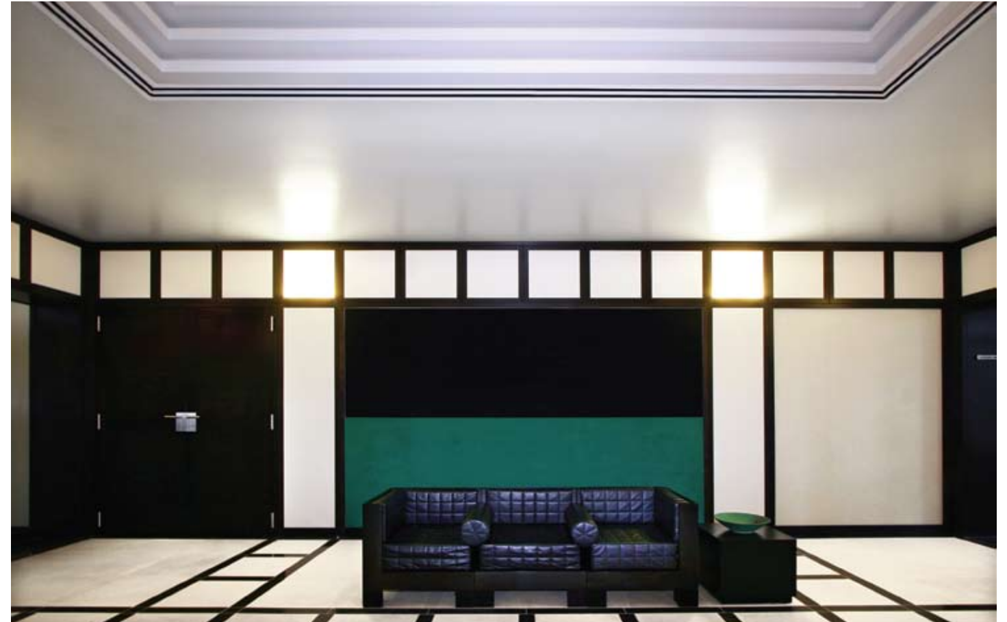
Left: Entrance Hall, Right: Entrance Hall

The residence is a showcase of contemporary German architecture in the United States. A symbol of cultural exchange between both countries, the natural exterior stone reflects the architectural legacy of 19th century Washington and the Greek Revival Era. The residence's