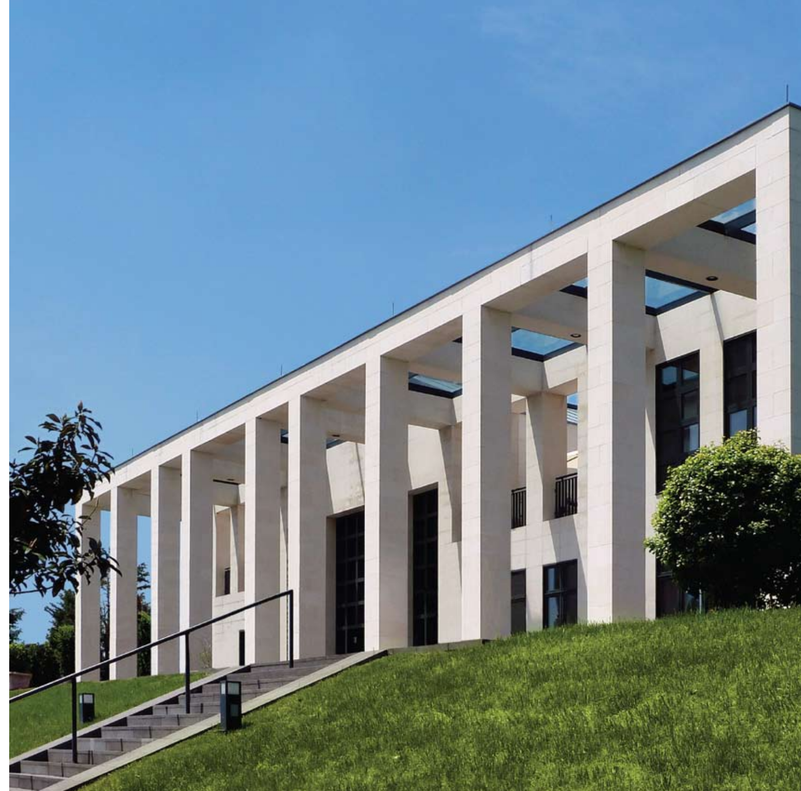
View of Terrace