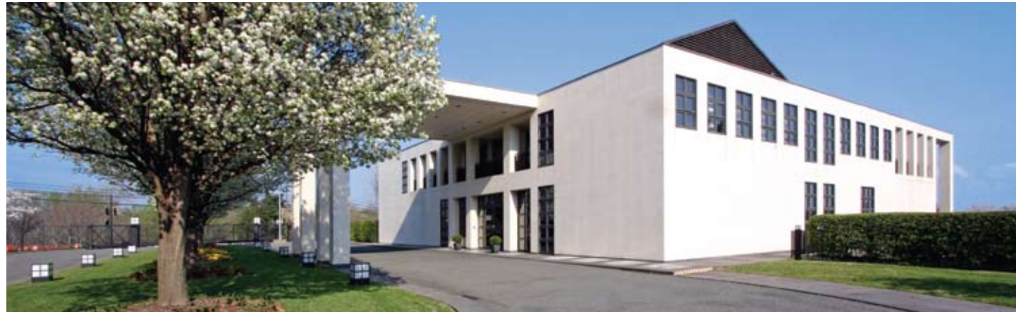
View of Entrance

The renowned German architect O.M. Ungers (1926 - 2007) designed the residence as an elegant yet utilitarian space. The building serves not only as a private residence, but also for official purposes and as a symbolic representation of modern Germany. Ungers' design evokes history with its classically inspired columns and portico, while also asserting a new vision through the concept of the square as a continuous module.