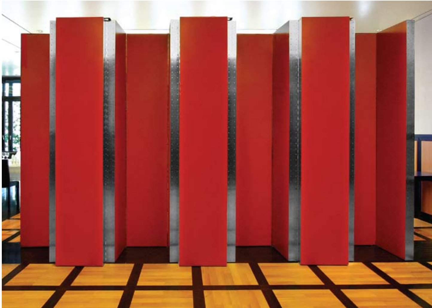
Folding Screen by Simon Ungers (extended), Dining Room