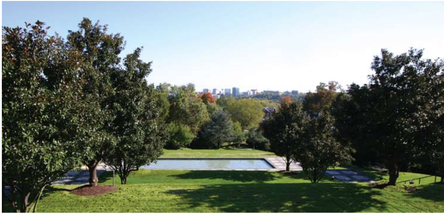
View of Reflecting Pool

the garden is accessible by staircases at each end of the terrace, which lead to a rectangular reflecting pool at the base of the hill. Then, interspersed by footpaths, the landscaped hill blends seamlessly into the original topography and natural vegetation.