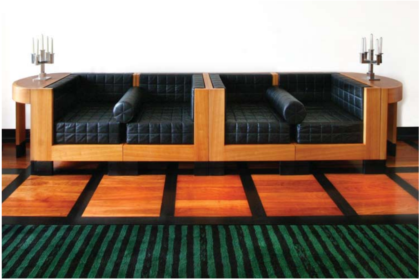
Sofa, Ladies' Sitting Room