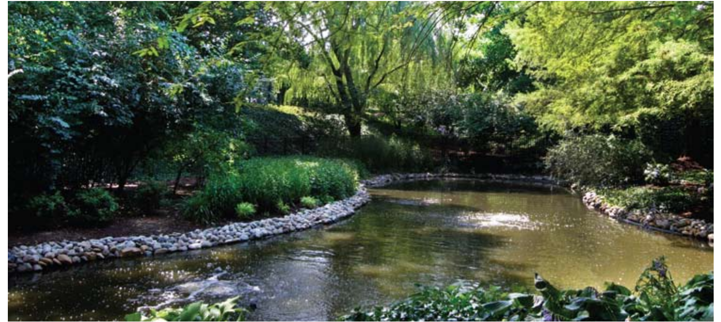
Left: Garden, Right: Pond

Beyond the Embassy's grounds lie the charming colonial brick houses of residential Washington. This leafy neighborhood known as The Palisades, located near Washington's historic Georgetown district, dips out of sight towards the banks of the Potomac River and gives way to the skyline of Rosslyn, Virginia, rising up from across the river. To the southeast, the tree-tops of the Embassy grounds frame the Washington Monument, located in the heart of the city's government district.