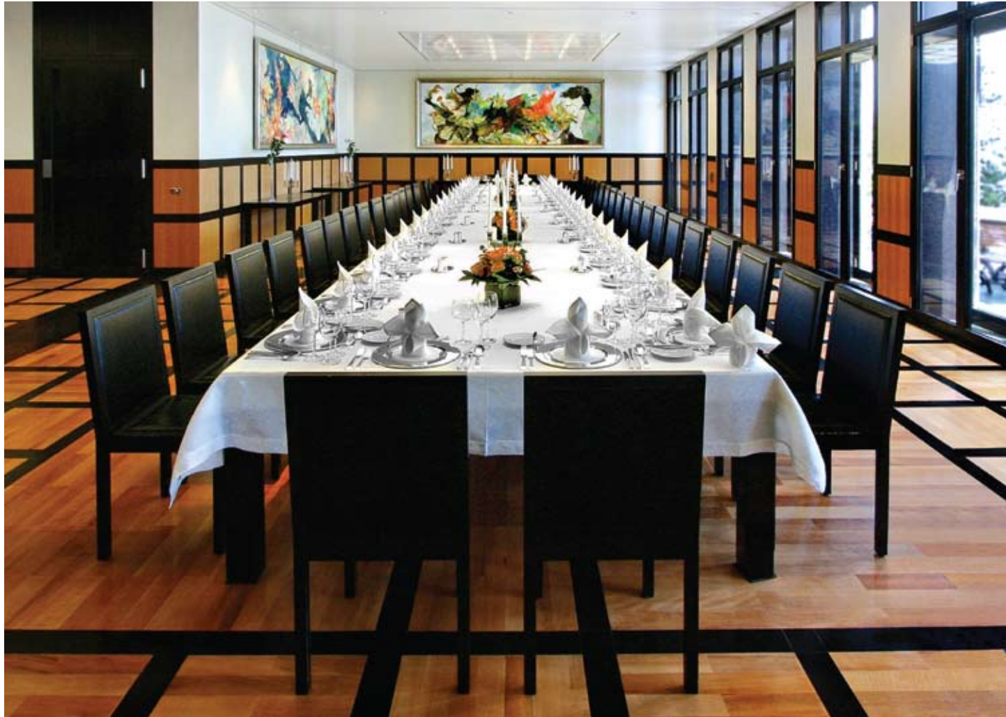
Dining Room, Paintings by Bernhard Schultze