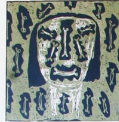
Paintings by Markus Lüpertz, Reception Hall

Twelve heads of Parsifal – color woodcuts on canvas from the “Men Without Women – Parsifal” series by the Düsseldorf-based artist Markus Lüpertz – overlook the hall, facing one another across the room from along the uppermost third of the two longest walls. A careful observer will notice symmetry at play here – the colorful portraits are set against imperfectly sketched grids, while the pieces themselves are arranged in a strict sequence. In this way, the artwork represents the residence’s architectural design and symbolizes its multiple functions as a formal meeting place and a private living space, but above all as an area for human interaction and cross-cultural exchange.